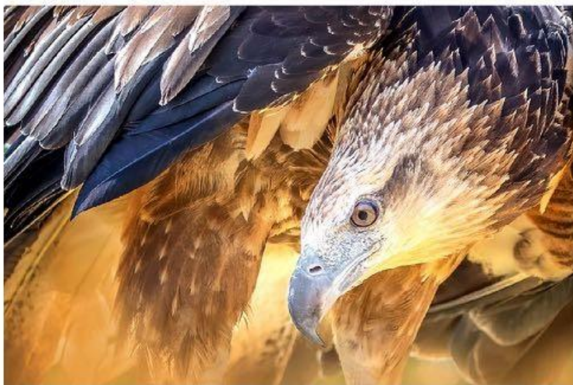
"Determined" by Cheryl Eagers