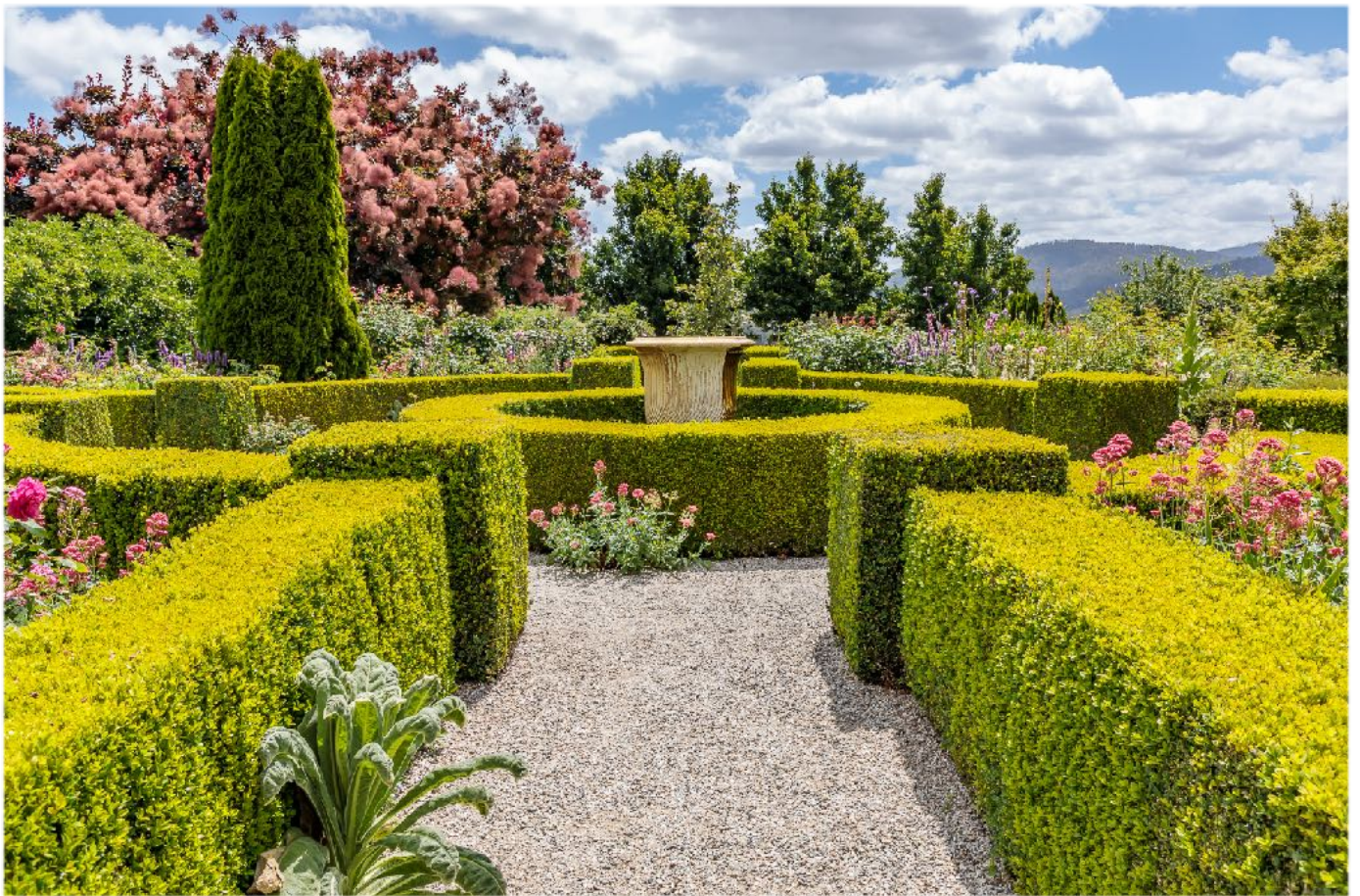
Broughton Hall, Jindivick.