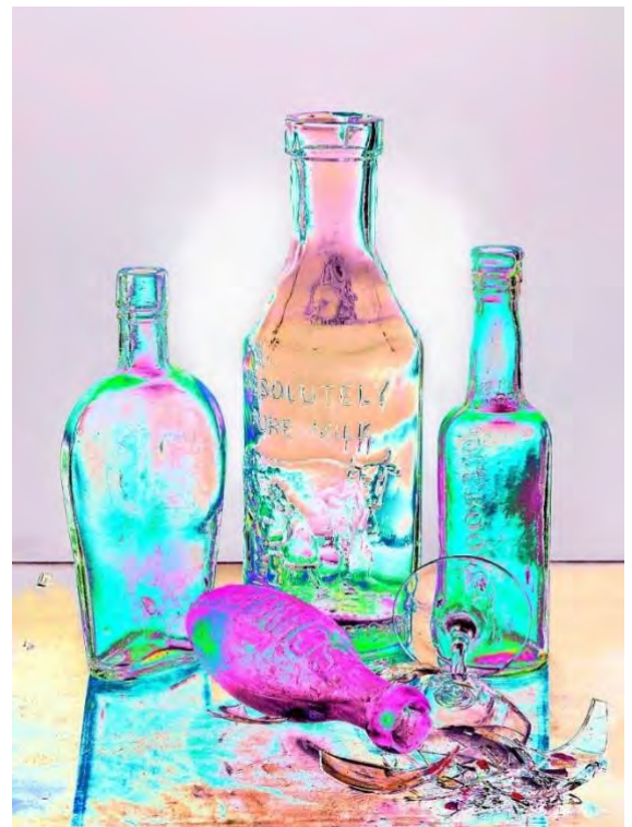
A Grade 1 st Place CREX Paul Robinson Playing with Glass

Please submit articles, images, interesting web links to the editor at: