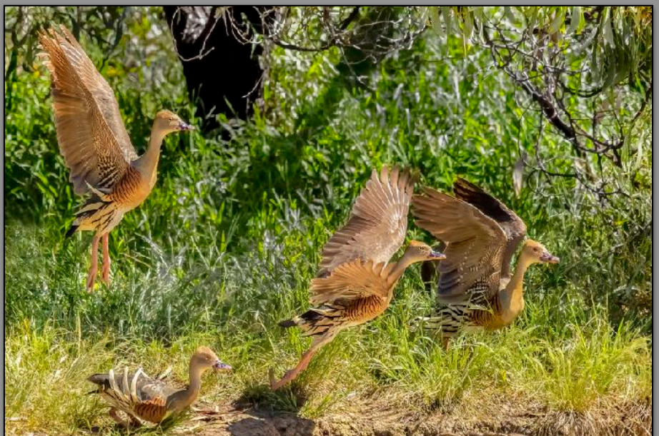
Plumed Whistling Ducks Take Off: Keith Ward. Second