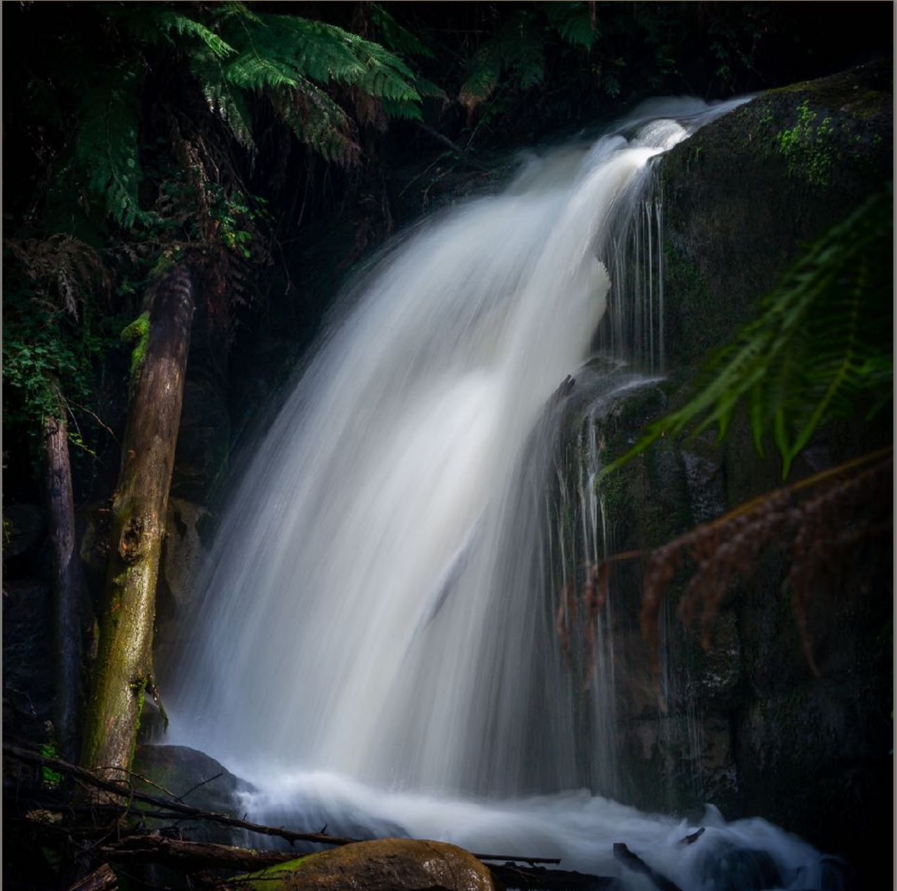
Toorong Falls: Des Lowe

Please submit articles, images, interesting web links to the editor at: