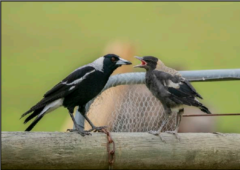
B Grade Projected Digital Image