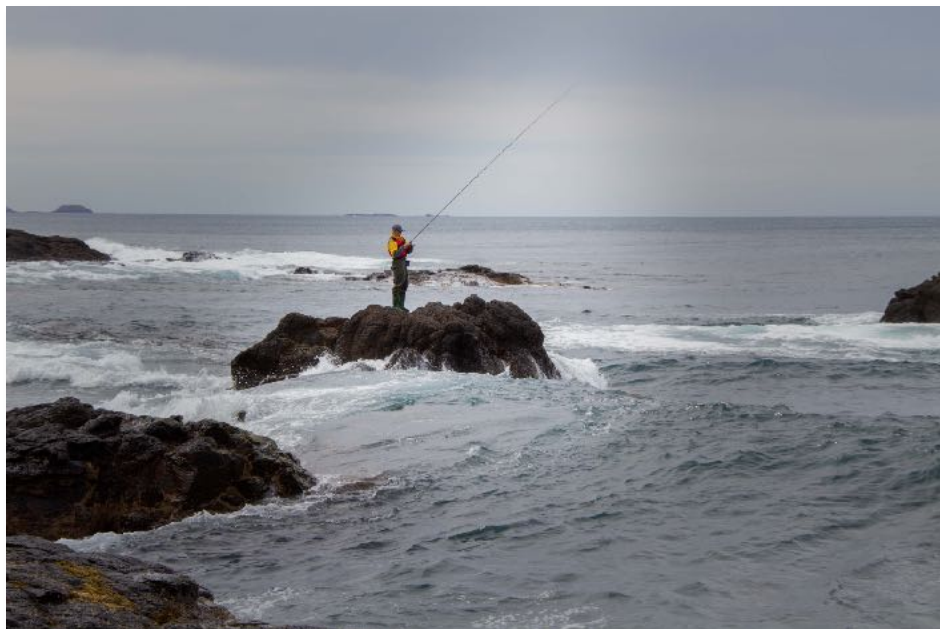
The Insane Fisherman: