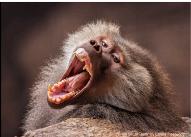
"Great Set of Teeth" by Emma Fleetwood