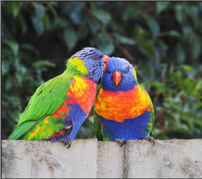
Colourful Couple: Nigel Beresford Third