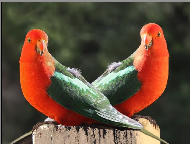
B Grade Creative (CREX)