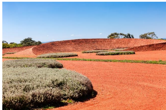
Canon 5D Mk III 1/250 sec at f/8.0 ISO100 EF70-200mm at 70mm