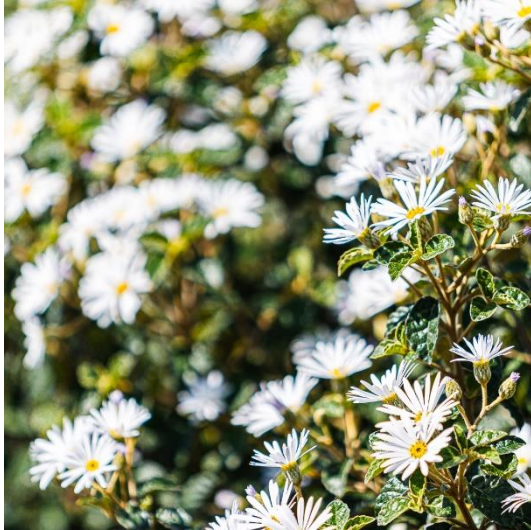
Canon 5D Mk III 1/1500 sec at f/2.8 ISO100 EF70-200mm at 200mm Focus distance 3.82 m

Suitably located dark shadowed backgrounds behind well-lit subjects were not all that plentiful, so I had to find another way. One of the workshops I am looking forward to at BFOP (Bright Festival of Photography) is titled “Impressionists of The Digital Age”. While I don’t know what that will be, I took the idea as inspiration for further experimentation using the same long lens, and shallow depth of field.