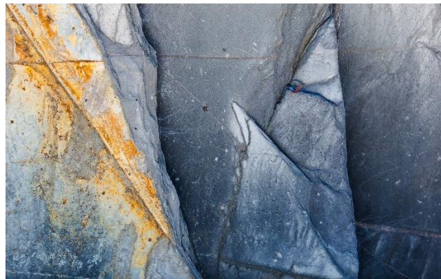
Canon 5D Mk III 1/350 sec at f/2.8 ISO100 EF70-200 at 115mm Focus distance 3.82 m

“Perfect” weather or not, there is always something to photograph if you are prepared to get out there and experiment.