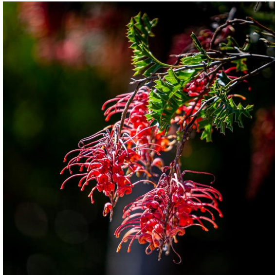
Canon 5D Mk III 1/750 sec at f/2.8. ISO100 EF70-200 at 195mm Focus distance 3.82 m

Difficult conditions can be a great opportunity to experiment. I decided to get in close.