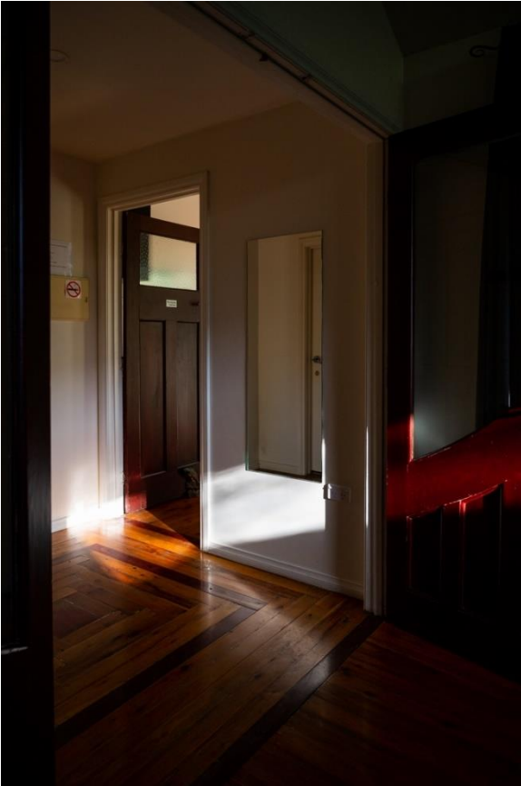
MORNING LIGHT- Carol Monson